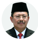
Prof. Dr. dr. Letjen. Purn. Terawan Agus Putranto